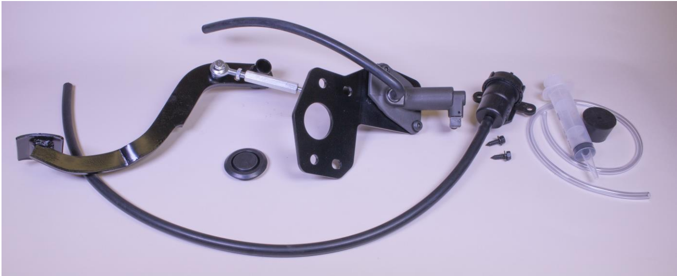
Pedal shown for reference only.