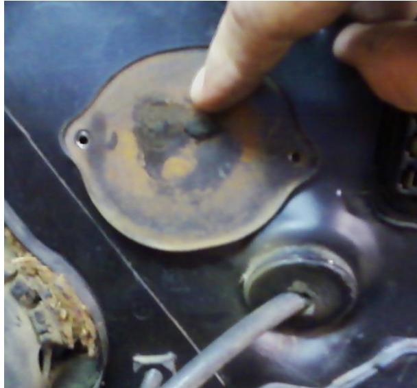
Shown is 67-69 Camaro

2.2 Remove the clutch rod cover from the firewall (automatic conversion only).