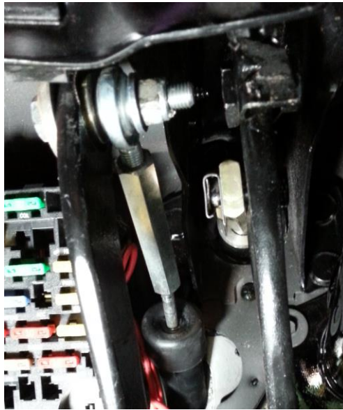
72-81 Installation shown – hardware will vary.