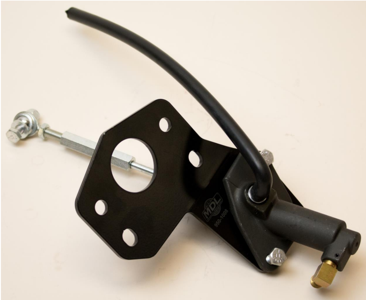
Picture above shown with mock-up fasteners.

3.2 Pre-assemble the Master Cylinder and firewall plate assembly as shown.