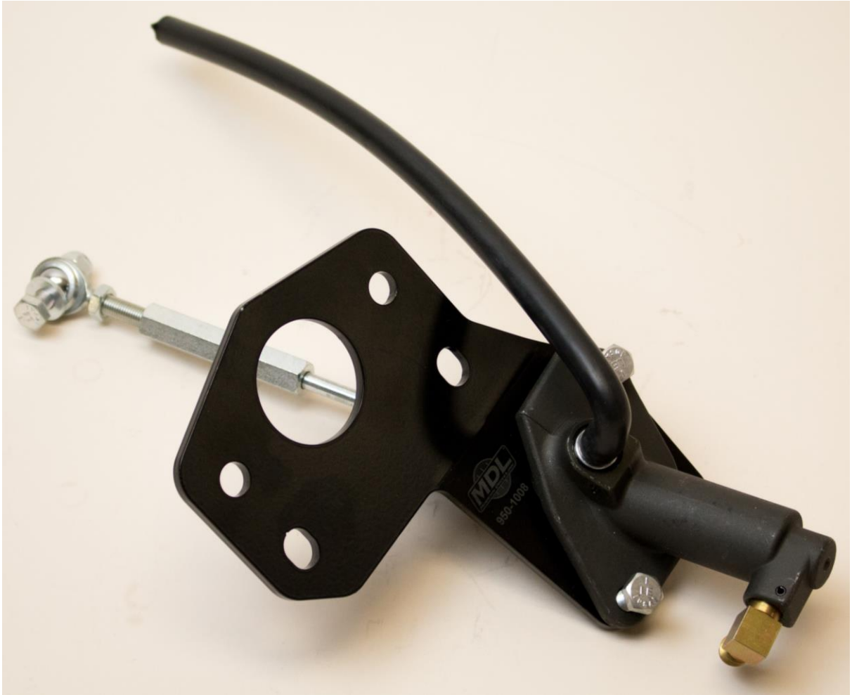
Picture above shown with mock-up fasteners.

3.2 Pre-assemble the Master Cylinder and firewall plate assembly as shown.