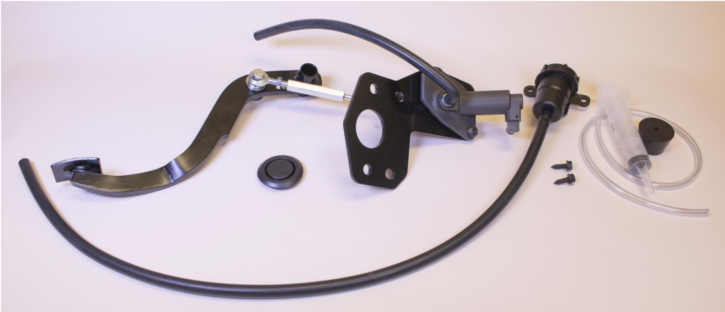
Pedal shown for reference only.