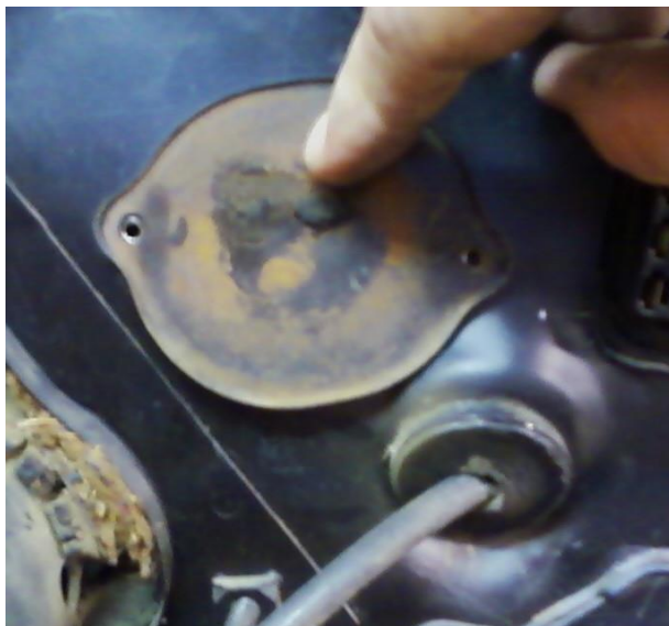
Shown is 67-69 Camaro

2.2 Remove the clutch rod cover from the firewall (automatic conversion only).