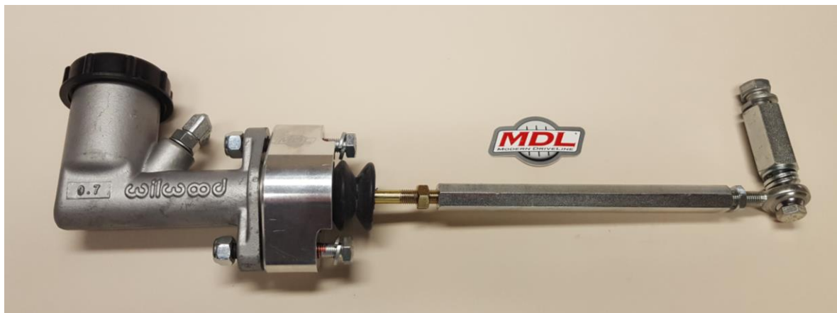
All components lightly assembled.

Modern DriveLine offers a complete line of Vehicle Specific Hydraulic Kits and we're adding more all the time.